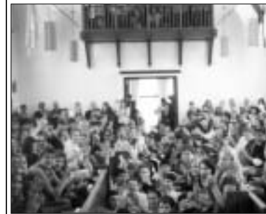
Expectant faces-gathered in the Chapel-Spring 2003.

So, in light of all that, if you still need to know Wooster Varsity Baseball statistics, they are: 1 Win, 8 Losses...and a lot of heart.