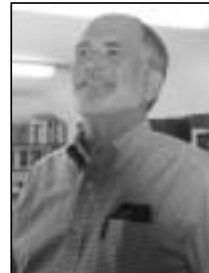
MR. EYNON What are you waiting for?