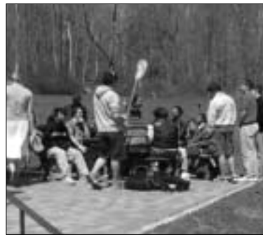
The patio off the Student Center., a gift from the Class of 2001.