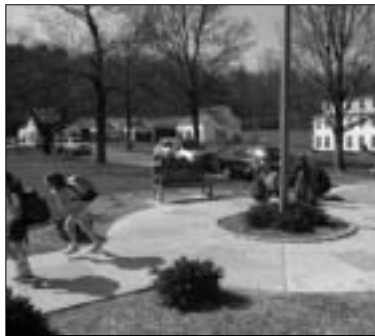
The Remembrance Garden, gift of the Class of 2002

The seniors raise the money for their gift through myriad ways, such as bake sales, car washes, the selling of Christmas wreaths, and family donations. As a class, this is an opportunity to come together one last time before graduation to give a lasting gift to the school. Likewise, the school is left with a permanent memory of the class.